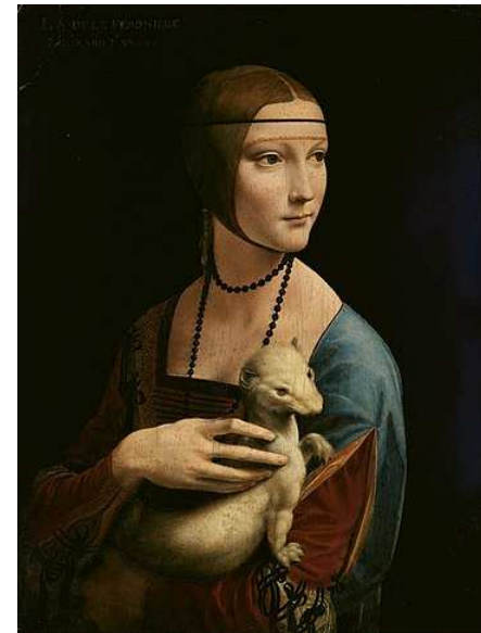
[Czartoryski Museum, Kraków, PL]